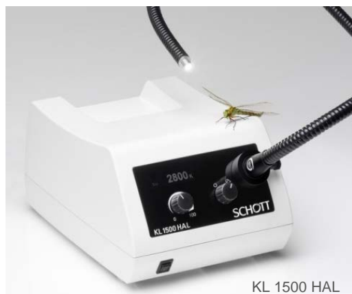
KL 1500 HAL

A benchmark for colors and functionality