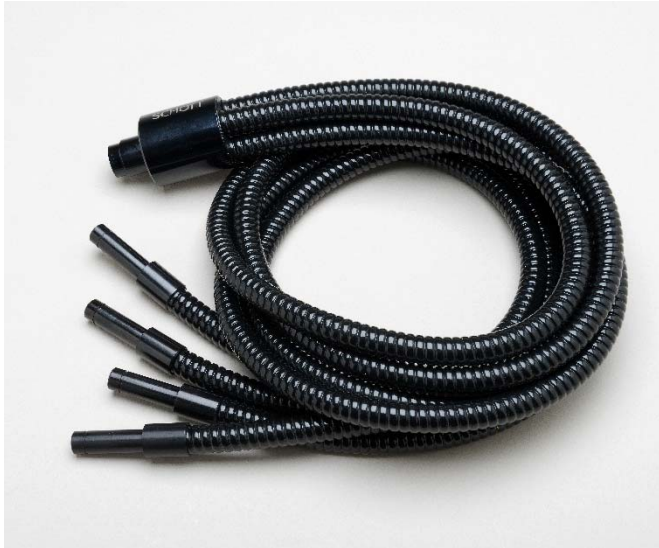
Quad Bundle, A08545

Flexible bundles give the user versatility when routing and positioning light.