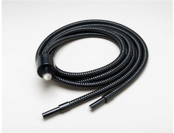
Dual Bundle, A08550.72

Bundle Input: Black Anodized Aluminium Bundle Sheathing: PVC Covered Metal Tubing